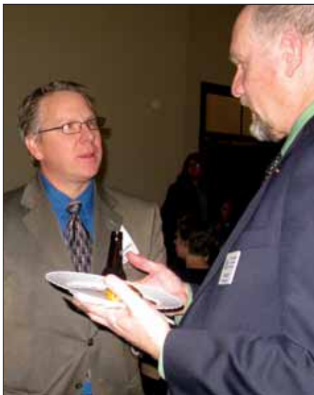
AMES CHAMBER OF COMMERCE PHOTOS

Sponsors of the December Business After Hours included these great Chamber members: Friedrich Iowa Realty, 3M, Ames Tribune, Integrity Friedrich Construction Services, Hy-Vee, Sauer-Danfoss, U.S. Bank, and the ISU Alumni Center.