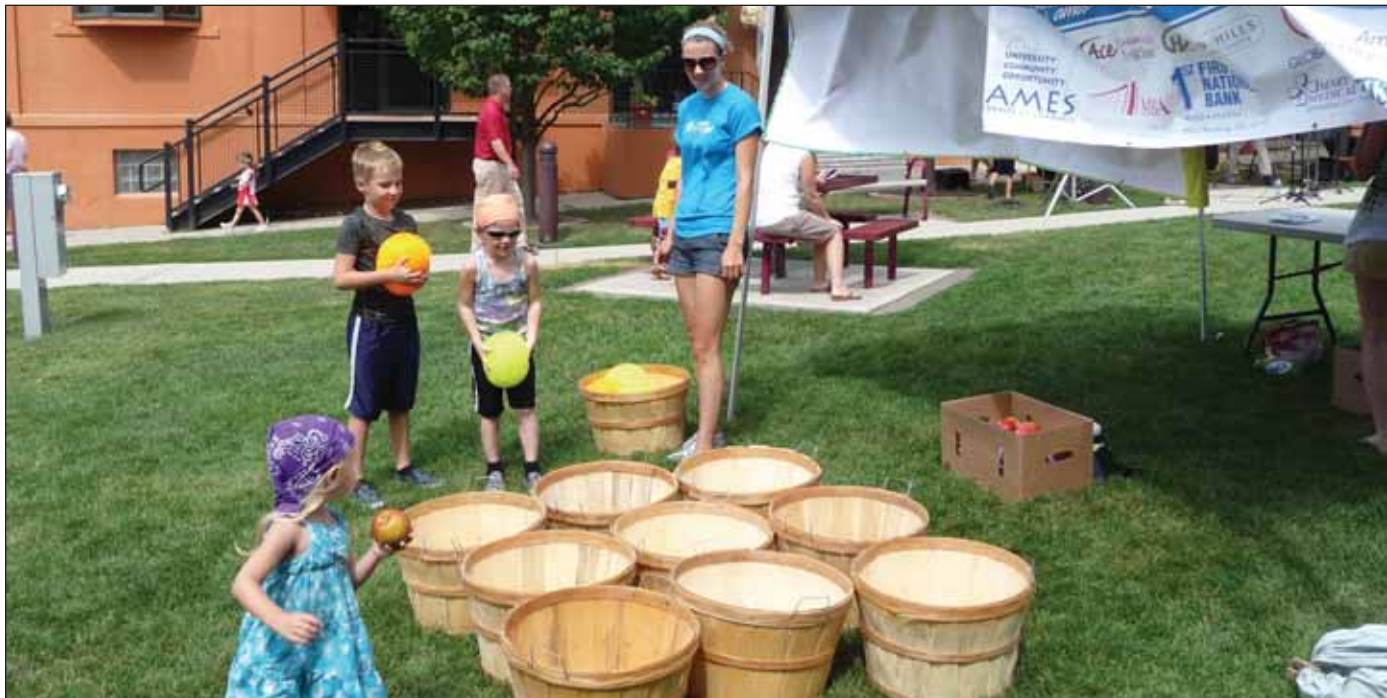
CHAMBER OF COMMERCE PHOTO

YPA Kids Zone is every Saturday during the Farmers Market and still needs volunteers.