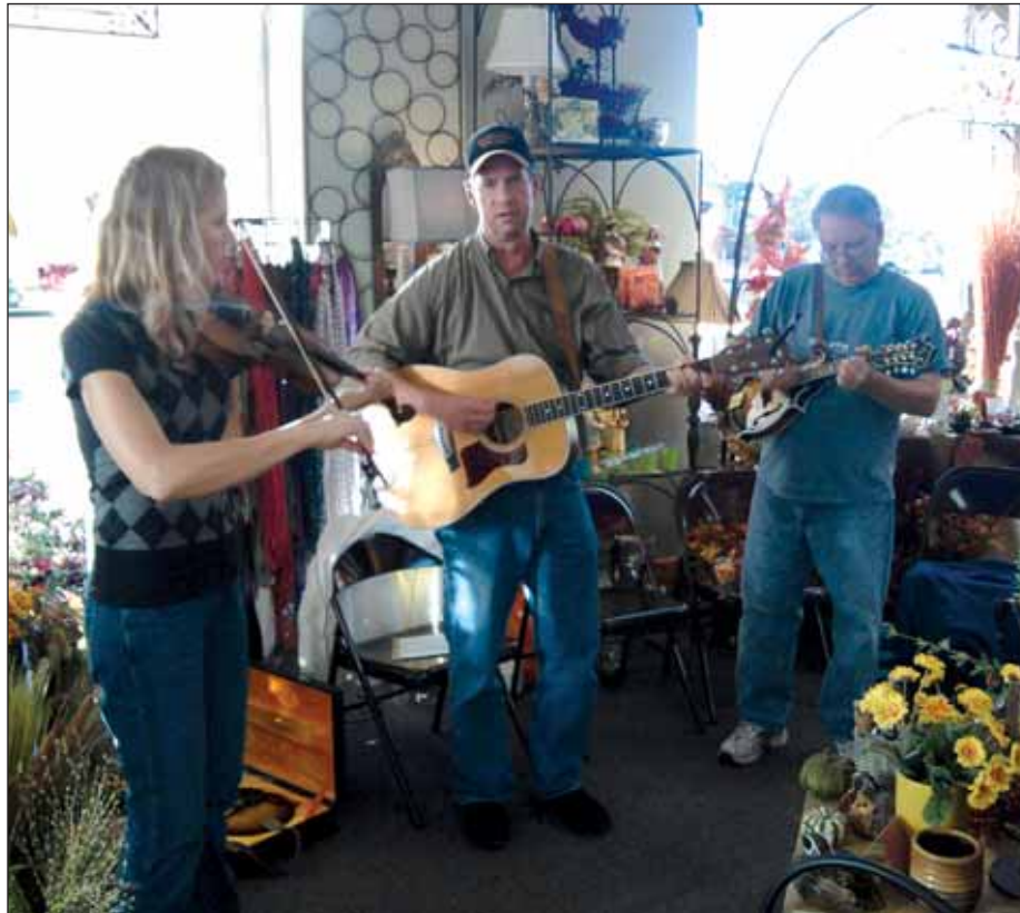
CHAMBER OF COMMERCE PHOTO

As the first season of the Ames Main Street Farmers' Market transforms with