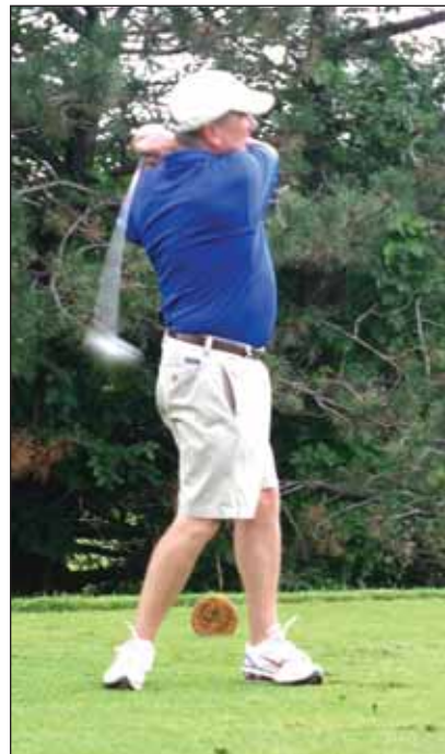
CHAMBER OF COMMERCE PHOTO