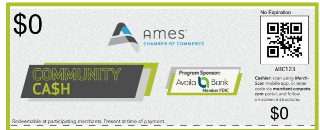
Example certificate a customer will present at purchase